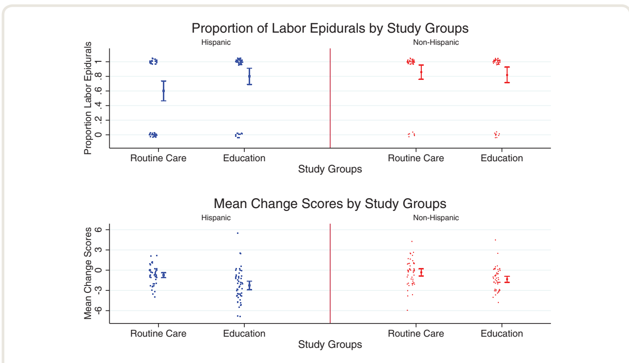
Fig. 2. Proportion of labor epidurals and mean change scores for misconceptions about labor analgesia, stratified by ethnicity and randomization assignment. Proportions and mean change scores are shown by the squares and circles, and the 95% CI values are shown by the whisker bars. The Hispanic cohort is in blue, and the non-Hispanic cohort is in red.

However, we believe this potential is low as the study primary endpoint was objective and identified from the electronic health record. The potential for bias was minimal also for the epidural questionnaire, which was administered on paper in the patient’s preferred language, limiting the potential for researcher influence. The topic areas covered by the epidural questionnaire were specifically addressed in the educational program. It is not possible to discern whether the change in the responses to the epidural questionnaire resulted from change in knowledge or beliefs; however, the