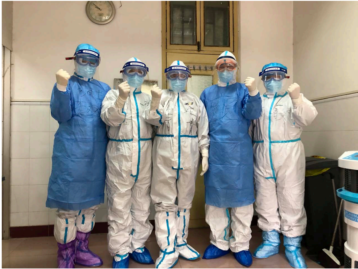
Fig. 1. Psychologic preparation and self-encouragement.

and protective measures in order to safely provide care to patients. Psychological support may also be needed for healthcare workers providing direct care to infectious patients (fig. 1).