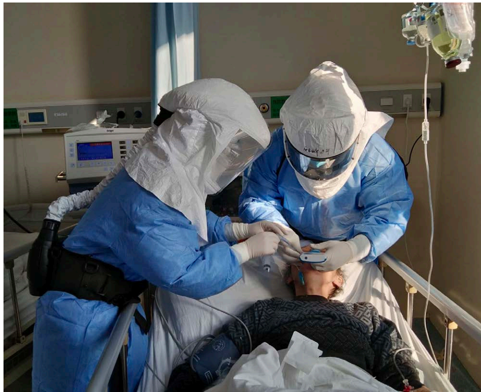
Fig. 4. Intubation with video laryngoscopes and keeping distance from the head of patient.

effort is needed to avoid severe hypoxemia. The choice of induction drugs is dictated by hemodynamic considerations. Midazolam 2 to 5 mg with etomidate (10 to 20 mg) or propofol, if the patient's hemodynamics allow, can be used for induction. Fentanyl 100 to 150 \mu g or sufentanil of 10 to 15 \mu g is recommended to be administered intravenously for an adult patient to suppress laryngeal reflexes and provide optimal conditions for intubation. If no contraindications are present, succinylcholine 1 mg/kg should be administered immediately after loss of consciousness, and intubation can be carried out after muscle fasciculation is completed. If rocuronium 1 mg/kg is used, sugammadex should be immediately available in case "cannot intubate/cannot oxygenate" is encountered. For critically ill patients with COVID-19 pneumonia, patients may develop pulmonary hypertension. The care team must make a great effort to avoid or minimize hypercarbia.