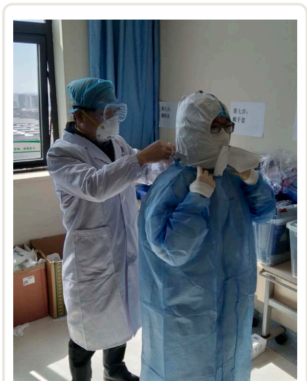
Fig. 2. Personal protective equipment self-check and inspection by another colleague.

Caution should be taken to ensure that the wet gauze does not obstruct the patient's airway. Sufficient muscle relaxation should be obtained to prevent coughing during intubation.