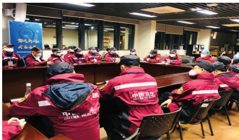
Fig. 1. A multidisciplinary meeting to discuss the operation of Wuchang temporary COVID-19 specialty Ark Hospital.

In creating these temporary hospital structures, we were guided by several design strategies, including the following.