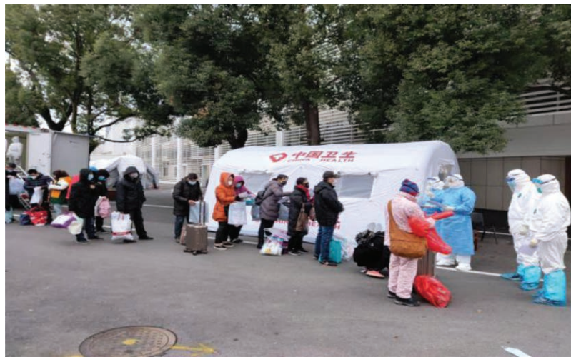
Fig. 3. Screening Ark in vehicles for Wuchang Ark Hospital.