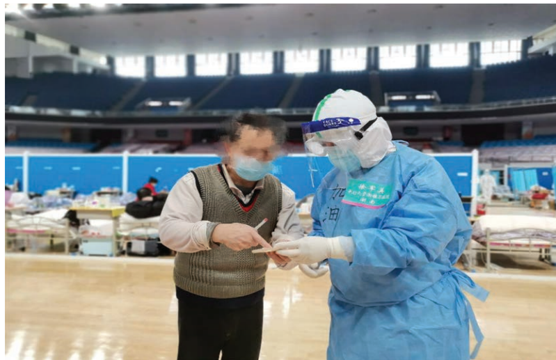
Fig. 4. A physician (J.X.) communicates with a COVID-19 patient inside Wuchang Ark Hospital.

patients with mild COVID-19 symptoms; patients with severe diseases are transferred to comprehensive hospitals.