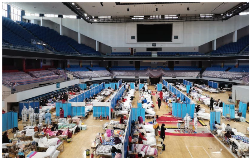
Fig. 2. Bird's eye view of Wuchang temporary COVID-19 specialty Ark Hospital.

Staffing wise, the ratio is 10 physicians and 40 nurses for every 100 patients in the Ark Hospital to ensure timely care of our patients (fig. 4). Our goal is to have zero infection for healthcare providers, zero in-hospital deaths among admitted patients, and zero readmission for discharged patients. It is important to clarify that our Ark Hospital only admits