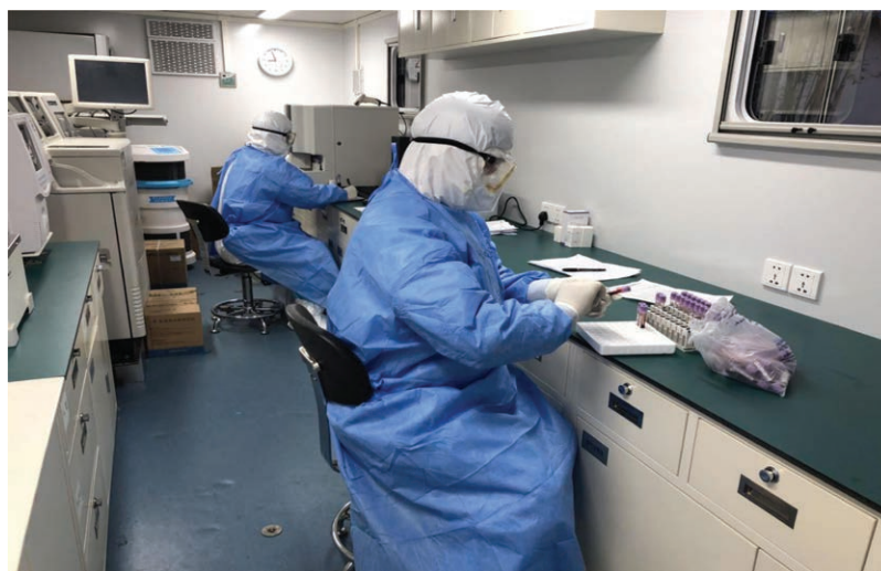
Fig. 5. Laboratory testing for novel coronavirus by physicians and technicians in the Screening/Testing Ark.

A temporary COVID-19 specialty hospital model significantly improved the diagnosis, admission, isolation, and treatment