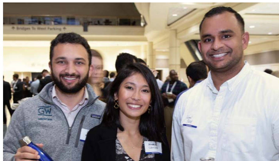
Residents engage with their peers at the 2019 Residents Reception. ANESTHESIOLOGY 2020 will offer several virtual opportunities to foster engagement.

A s a medical student or resident at ANESTHESIOLOGY 2020, you will have access to a wide range of educational sessions guaranteed to ignite your interest and excitement for the specialty.