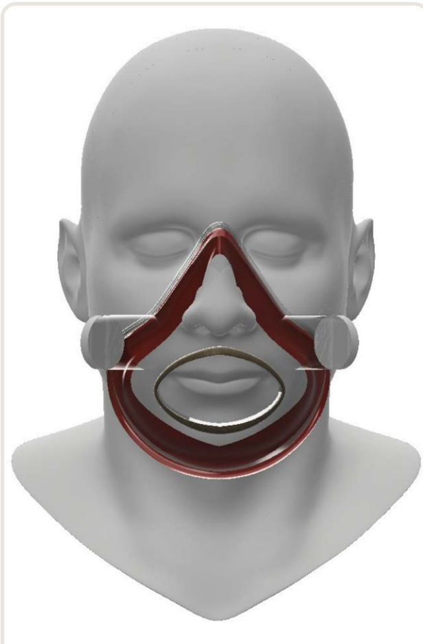
Fig. 4. Artist's conception of improved elastomeric respirator, with filter ports on either side of the respirator facepiece; the filters are deliberately not shown. The respirator body is transparent, and there is a speaking diaphragm to facilitate communication. The respirator would accommodate a wide variety of filters through the use of adapters, which could make the respirator more suitable to surge situations in which the supply chain for filters could be interrupted. The sealing surface is highlighted. There is no exhalation port; inhalation and exhalation take place through the same filters. Straps that hold the respirator onto the face are deliberately not shown, but are an important feature for fit and comfort. In the United States, respirators are certified for use by the National Institute for Occupational Safety and Health (Washington, D.C.); thus, the National Institute for Occupational Safety and Health would need to be involved in improved elastomeric respirator design.

and stockpiling of improved elastomeric respirators around the world should be an international public health priority.