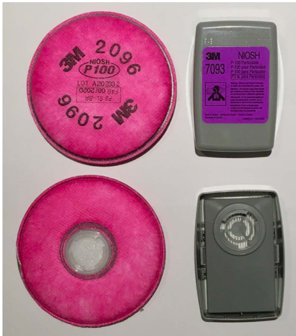
Fig. 2. Examples of elastomeric respirator filters. The outer facing side of the filters is shown in the upper photos , and the side of the filters that attaches to the respirator is shown in the lower photos . Both filters are P100 (equivalent to high-efficiency particulate air). The filtering material of the left filter is exposed, while the filtering material of the right filter is completely enclosed in plastic. The right filters are also shown mounted on an elastomeric respirator in fig. 1C.

increase leakage around the respirator facepiece. Resistance to breathing also affects comfort and tolerability. 26 In the United States, the National Institute for Occupational Safety and Health requires that respirator filtering material be tested for the pressure gradient across the filtering material at 85 l/min constant airflow; the “inspiratory” pressure gradient must be less than 35 mm H 2 O (343 Pa), and “expiratory” pressure gradient must be less than 25 mm H 2 O (245 Pa). Methods for testing the pressure gradient across filtering material typically specify the cross-sectional area of the material to be tested, since the cross-sectional area affects the pressure gradient under conditions of constant volumetric flow rate. The National Institute for Occupational Safety and Health method for certifying filtering facepiece respirators specifies