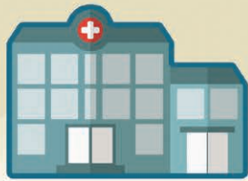
300-bed urban teaching hospital with 28 anesthetizing locations

et al. describe a quality improvement project aimed at attaining documented quantitative TOF ratios \geq 0.90 in all patients receiving NMB. 2