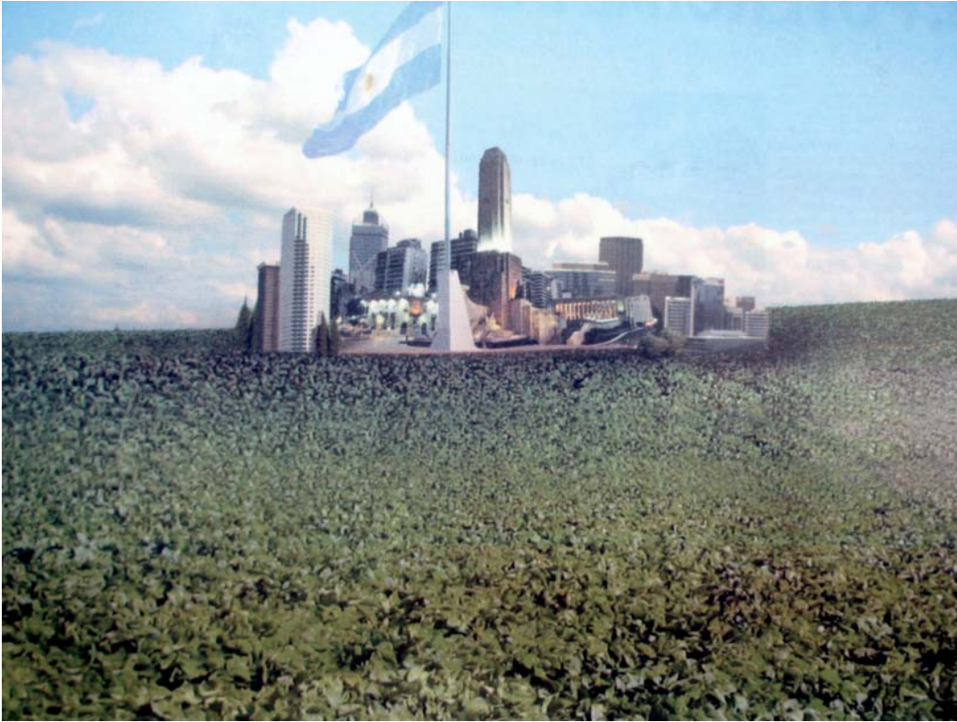
Figure 1. Eduardo Molinari / Archivo Caminante. Fragment of the publicity campaign “Infocampo. La expo” published in La Capital de Rosario in June 2008. DocAC/2010.

get numbed after exposure to the herbicide. A proverbially healthy countryside has been turned into a contaminated bio-industrial revolution site.