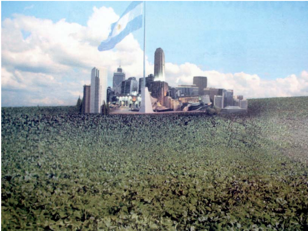
Figure 1. Eduardo Molinari / Archivo Caminante. Fragment of the publicity campaign “Infocampo. La expo” published in La Capital de Rosario in June 2008. DocAC/2010.

get numbed after exposure to the herbicide. A proverbially healthy countryside has been turned into a contaminated bio-industrial revolution site.