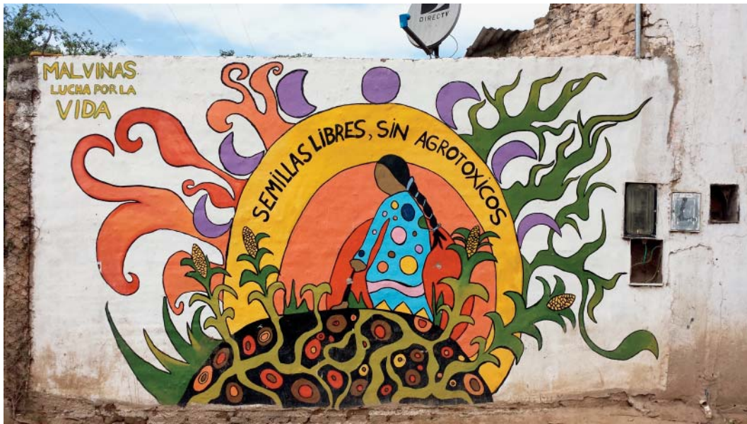
Figure 3. The graffiti on the bus stop in Malvinas Argentinas: “Free Seeds with no pesticides”

they camped by the side of the highway in front of the factory for over two years, they grew a small organic garden and printed cartonera -style books that they gave to visitors for voluntary donations. In the book that we took with us, the protesters represent themselves through the metaphor of “lobitos huerta” (little garden wolves), which implies a return to a more organic animalistic relation with agriculture. 70 In the manifesto contained by the book, images of people and plants and, in particular, of women embracing a tree and a couple leaning over a sprouting plant, highlight the interspecies character of their thought, inspired by other acts of resistance (fig. 4). 71