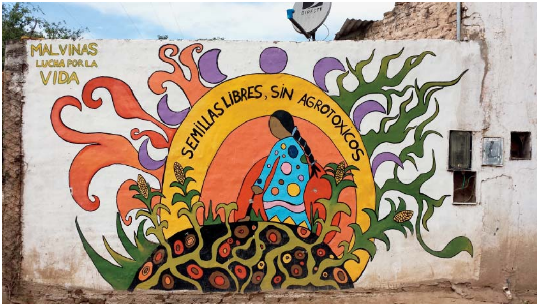
Figure 3. The graffiti on the bus stop in Malvinas Argentinas: “Free Seeds with no pesticides”

they camped by the side of the highway in front of the factory for over two years, they grew a small organic garden and printed cartonera -style books that they gave to visitors for voluntary donations. In the book that we took with us, the protesters represent themselves through the metaphor of “lobitos huerta” (little garden wolves), which implies a return to a more organic animalistic relation with agriculture. 70 In the manifesto contained by the book, images of people and plants and, in particular, of women embracing a tree and a couple leaning over a sprouting plant, highlight the interspecies character of their thought, inspired by other acts of resistance (fig. 4). 71