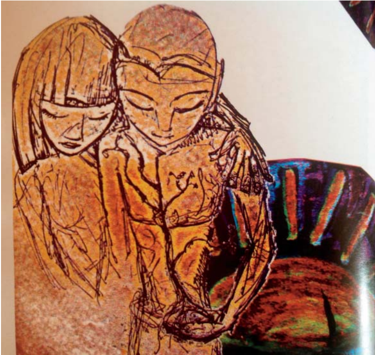
Figure 4. Drawing produced between the barricades during the blockade of Malvinas Argentinas. Credit: Guiye pincel of the group arte x libertad.

La raíz se abriga en la tierra fresca y blanda. Desde ahí se radicaliza la práctica. (The root is covered by the fresh and soft soil. From there the practice is radicalized.)