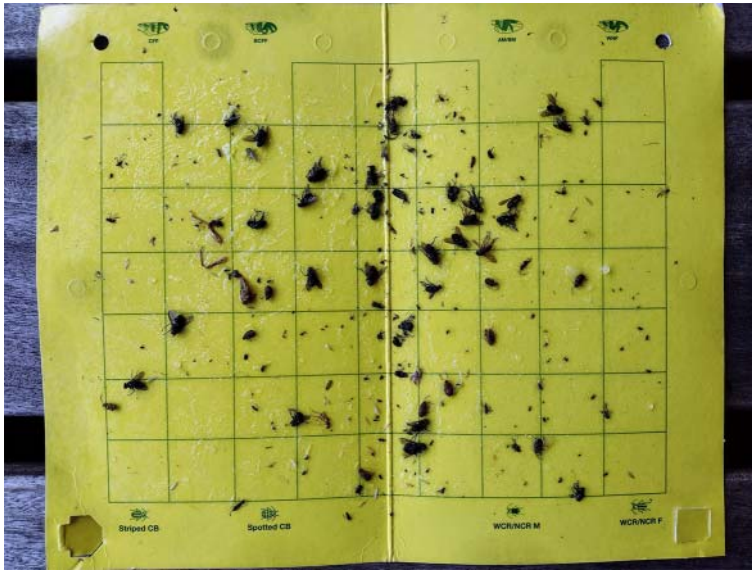
Figure 1. Example of a sticky card covered in dead insects, after deployment and collection from a New York highway roadside in 2021.

into the glue card. Freezing, too, which provides temporal flexibility for researchers, degrades tissue and can contribute to insects breaking when handled for identification in the lab. This efficient collection technique thus results in a bunch of squished, broken bugs (fig. 1).