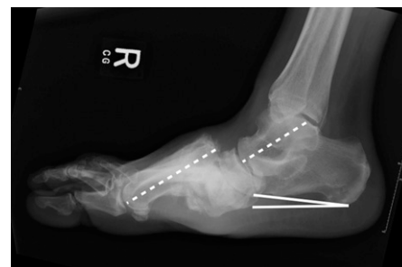
Figure 2 —Lateral X-ray of a Charcot foot deformity showing a dislocation of the tarso-metatarsal joint with break in the talo-first metatarsal line (dashed lines) and a reduced calcaneal inclination angle (solid lines).

Experts agree that radiographs are important as the first exam in virtually all settings (33,34). However, a negative result obviously should not offer any confidence regarding lack of disease. In a patient with low clinical suspicion of osteomyelitis and no sign of CN on radiographs, either three-phase bone scan or