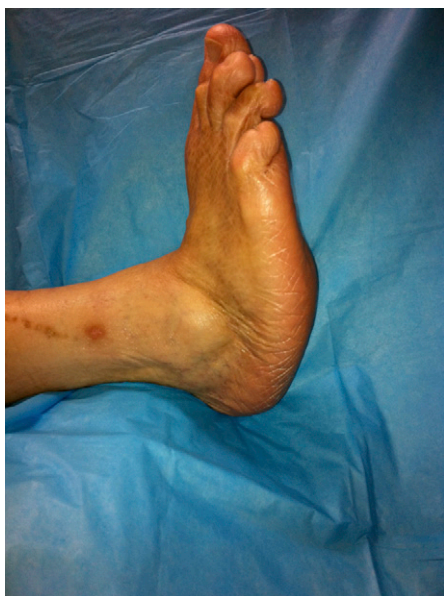
Figure 1 —The typical appearance of a later-stage Charcot foot with a rocker-bottom deformity.

ligand (RANKL) from any of a number of local cell types. RANKL triggers the synthesis of the nuclear transcription factor nuclear factor- \kappa\beta (NF- \kappa\beta ), and this in turn stimulates the maturation of osteoclasts from osteoclast precursor cells. At the same time, NF- \kappa\beta stimulates the production of the glycopeptide osteoprotegerin (OPG) from osteoblasts. This “decoy receptor” acts as an effective antagonist of RANKL (2). The fracture will also be associated with pain, and this leads to splinting of the bone, and the rise in proinflammatory cytokines is usually relatively short-lived. In the person who develops an acute Charcot foot, however, the loss of pain sensation allows for uninterrupted ambulation, with repetitive trauma. It has been suggested that this results in continual production of proinflammatory cytokines, RANKL, NF- \kappa\beta , and osteoclasts, which in turn leads to continuing local osteolysis (1). This has subsequently been shown by an increase in proinflammatory phenotypes of monocytes in those with active Charcot foot when compared with diabetic control subjects (3).