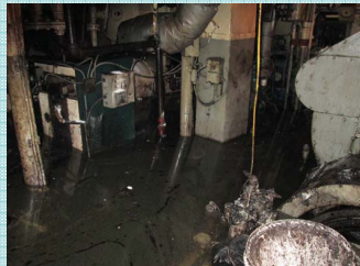
Condition of engine room with improved visibility after use of solidifier granules.

Problem: 184' single hull vessel was beached on Staten Island with 80% of vessel out of the water. Engine room pumped of 815-gal oil-water mix however on flood tide it refilled with sea water from the surrounding environment therefore there was free communication between the M/T and surrounding sea environment.