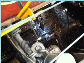
Oiled Engine Room prior to use of solidifier