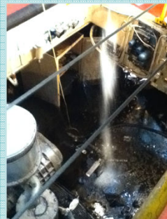
Solidifying agent being applied to engine room