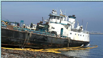
M/V John B. Caddell beached on Staten Island

Additionally, National Strike Force and Coast Guard Sector New York personnel utilized the cutting edge technology of solidifying polymer agents to effectively reduce the amount of contaminants onboard the vessel. As per the Area Contingency Plan, the Regional Response Team-Region 2 (RRT-2) was activated, and was used to brief Federal and State member agencies on the planned protective use of a solidifier by the Federal On-Scene Coordinator during cleanup efforts. RRT-2 was provided a current situational brief, objectives, and a proposed application plan. RRT-2 concurred with the utilization plan, and contributed some additional recommendations, which enhanced cleanup operations conducted under the ESF-10 Mission Assignment from New York State.