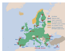
Figure 1: EU response vessel locations

Until an EU database of potentially polluting wrecks has been developed, however, upon which the assessment described below can be undertaken, these numbers remain unknown and a relatively small number of potentially polluting wrecks remains an assumption.