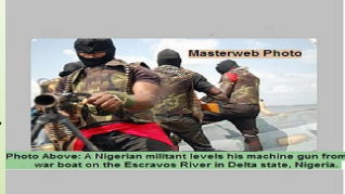
Photo Above: A Nigerian militant levels his machine gun from the war boat on the Escravos River in Delta state, Nigeria.

Spill consequences cause conflicts between communities, individuals and oil companies. Conflicts are mostly caused by occupational disorientation, increased poverty and Differential spill payment compensation.