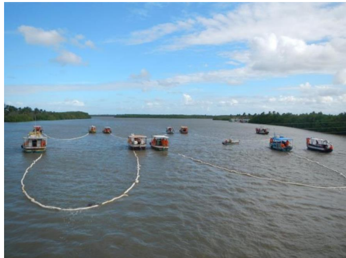
Figure 4 – Equipment deployment during VoOs practical training sessions.

Vessels and crew were sorted according to the assigned response tactics (e.g., oil deflection, oil recovery, protection with sorbent material etc.) and were provided with different types of training.