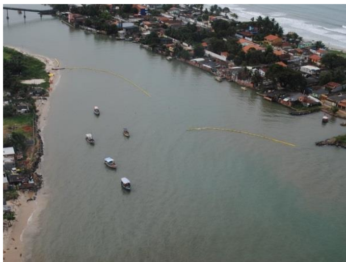
Figure 5 – Full Deployment Exercise conducted in Barra de São Miguel.

Upon the activation by the Emergency Management Team (based in the company's Command Center in Rio de Janeiro) the shoreline protection structure that had been built for Barra de São Miguel throughout the development of the TRP, the conduction of the VoOs Program and the implementation of the Advanced Base was promptly activated. Within 03 (three) hours, the VoOs had been mobilized to the location, were equipped with response equipment and were executing response tactics according to the TRP, protecting the vulnerable resources Barra de São Miguel ( Figure 5 ).