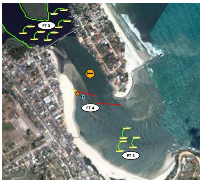
Figure 3 – Except from Barra de São Miguel’s Tactical Map, illustrating prescribed tactics, allocated resources and structuring of emergency response (response operations divided into different teams).

After sufficient data had been collected on the field, the work proceeded to the office, where the information was compiled and processed in order to generate the 3 (three) products described previously: Tactical Maps ( Figure 3 ), Emergency Management Forms and Pre-Spill SCAT Forms.