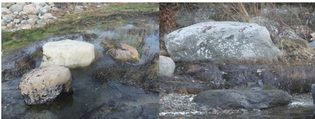
Figure 3: Oil contaminated shorelines, Tjörn

The Tjörn archipelago consists of about 50 islands and islets with the character of bare rocks. Many islands are bird sanctuaries and within the municipality there are also inlets to Stigfjorden Bay which is a Natural conservation area. The affected coastal area comprise rocky beaches with varying degrees of cracks, bays, rock pools, etc. The rough surface of these rocks accumulates the oil to a higher extent compared to smoother rocks. In the area there are also seals. Rocky beaches exhibit a high ecological value, and are frequently used for outdoor recreation.