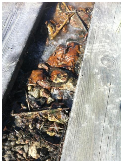
Figure 6: Opening of CTO impacted jetty, one year after the spill, the oil looks rather fresh

According to the safety data sheet, CTO should be readily biologically degradable. Initially, it was assumed that a majority of the CTO oil spill would degrade quickly. However, two years after the spill, oil not exposed to weathering by sun and wind (i.e. inside stone coffins and jetties, under rocks) remains nearly intact (Figure 6). An extensive long-term remediation action has been necessary in Söderhamn, contrary to initial expectations. However, CTO does not seem to produce asphalt-like structures, when left in thicker assemblies.