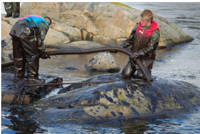
Figure 7: Remediation of oil at Tjörn