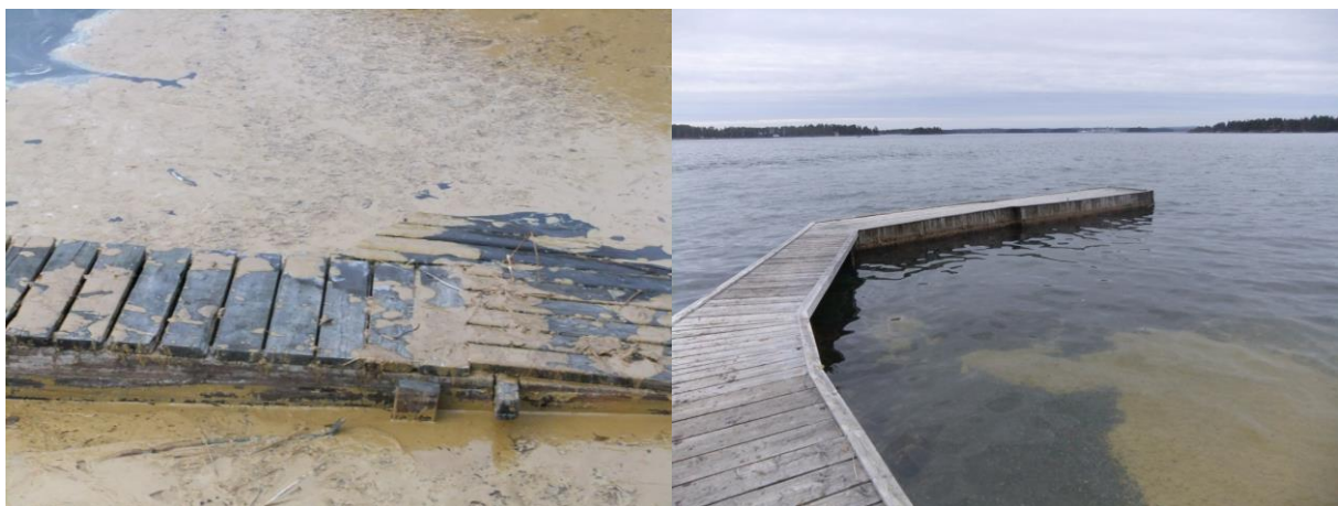
Figure 8: CTO impacted jetty (left), and remaining oil on sea bed (right)

Observations from the case studies indicate that extensive decontamination does not usually increase the recovery rate on the oil contaminated beaches. Therefore, we do not recommend cleaning up to level as "clinically clean". An overly harsh cleanup causes in general more damage to nature, removal of important microorganisms, increased soil erosion and increases the difficulty for the vegetation to recover clean-up efforts. If the oil on the beaches is degraded into less harmful components, the hydrocarbon may in fact act as food source for beach living organisms.