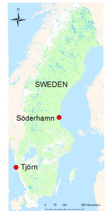
Figure 1: A map of Sweden and the areas (Tjörn and Söderhamn) being discussed in the paper

In 2011, the Swedish coastline suffered two major oil spills of different character. The first spill of about 500 tonnes of bunker oil occurred in the marine waters of the west coast, in the waters of Skagerrak, on to the coastline of Tjörn. The second spill, about 800 tonnes of CTO (crude tall oil) occurred from a land based tank farm on the east coast, into the Söderhamn archipelago in the brackish Baltic Sea (Figure 1).