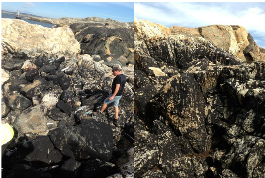
Figure 2: Remediated sites at Skaboholmen, Tjörn

The Tjörn archipelago consists of about 50 islands and islets with the character of bare rocks. Many islands are bird sanctuaries and within the municipality there are also inlets to Stigfjorden Bay which is a Natural conservation area. The affected coastal area comprise rocky beaches with varying degrees of cracks, bays, rock pools, etc. The rough surface of these rocks accumulates the oil to a higher extent compared to smoother rocks. In the area there are also seals. Rocky beaches exhibit a high ecological value, and are frequently used for outdoor recreation.