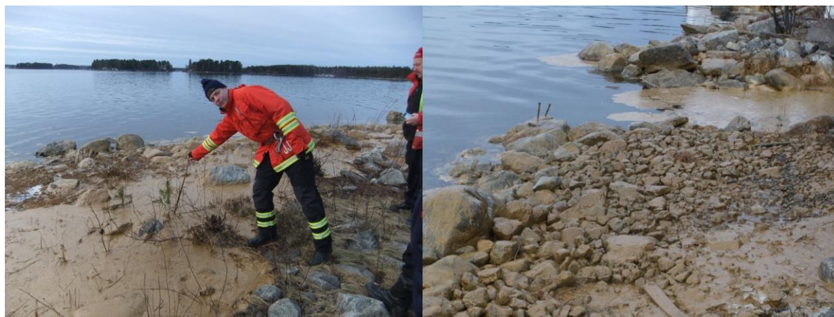
Figure 4: CTO impacted shoreline

property owners in the archipelago, many were affected due to contaminated beaches and jetties (Figure 8). The shores consist of rocky beaches, large rocks and very small pebble stones, making the clean-up very difficult and time consuming. It is a brackish water archipelago with high ecological and recreational value. However, in the sediments, there are remains from previous activities such as discharges of waste water and dumping of waste from the pulp and paper industry.