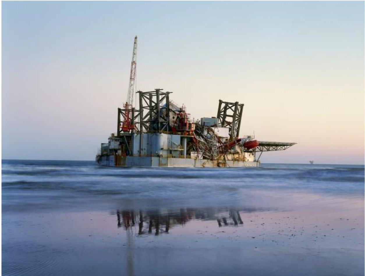
Figure 3. Mobile Offshore Drilling Unit Ocean Warwick , October 2005