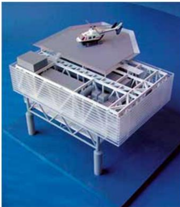
Figure 2. Electric Service Platform Example