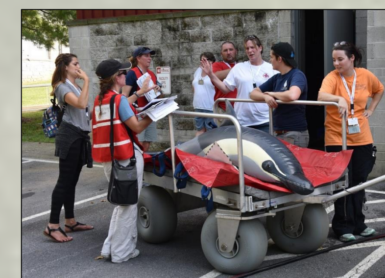
Full deployment drill, September 2016, testing oil spill guidelines with inflatable dolphins.