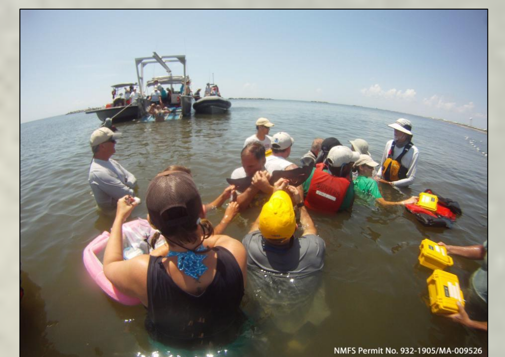
Bottlenose dolphin health assessment captures