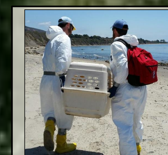
Recovery of a stranded oiled pinniped during the Refugio Beach oil spill.