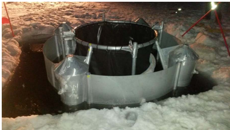
Figure 2. Mesocosm directly after installation.

burn residue resulting from burning 20 litres of KOBBE crude oil). In the mesocosm simulating natural attenuation this resulted in a slick of 1 cm thickness. KOBBE crude oil, produced by the GOLIAT oil field in the Barents Sea, was used in all of the experiments.