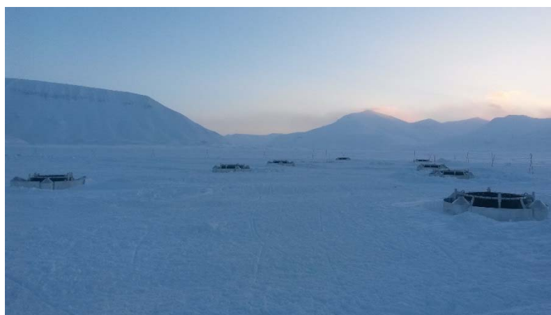
Figure 3. Overview of the eight mesocosms installed in Van Meijenfjorden, Svea, Norway.

clean and control sites. At each of the four sampling times (T1, T2, T3 and T4), water was collected at three different depths in mesocosms, using a manual pump: for T1, T2 and T3, just below the ice, at 1 m below ice, and at 2 m below the ice. For the T4, at 0.7 m, 1 m and 2 m below the sea surface. Deeper seawater samples were collected using Niskin bottles. Clean sites, located in the same fjord but approx. 120 m away from the mesocosms were also sampled.