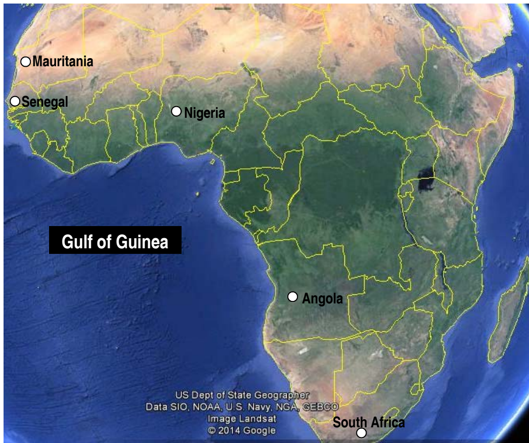
Figure 1: Map of Africa showing the coastal country boundaries (from Mauritania to South Africa) covered by UNEP's Regional Coordination Centre of the Abidjan Convention for combating marine pollution.

As of 2013, the general Gulf of Guinea area produces about 5.5 million barrels of oil per day – more than 60% of the total daily crude oil production in sub-Saharan Africa. Given the law of improbable incidents as demonstrated through the Poisson probability distribution formula (see Anderson et al., 2012), it is justifiable to raise concerns upfront about 'low frequency-high impact' incidents e.g. Spills of National Significance (SONS) and crucially, how environmental conditions in the Gulf of Guinea might influence response efforts. During the 2010 Deepwater Horizon (DWH) oil spill in the Gulf of Mexico, U.S. IOOS played a prominent role in the operational response phase (Section