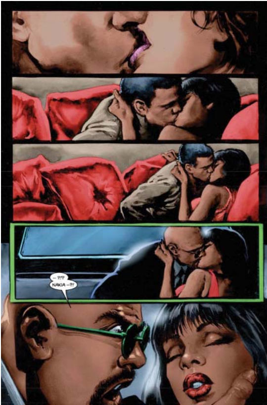
Figure 4 From Priest and Jusco (1999), Black Panther #6

with makeup, jewelry, and golden neck rings evocative of those worn by married Ndebele women in South Africa (Forbes 1998). T'Challa reassures her, "The role of the Dora Milaje is merely ceremonial. Your king shall not make demands of you"—a promise he will eventually break. The flashback insinuates that the Dora Milaje's relationships to the king represent alliances between disparate descent lines, fulfilling a purpose not entirely unlike marriages among the European aristocracy. The betrothal arrangement among villages, regions, and the seat of government sutures heterogeneous social formations within the fictitious country to its principal power center: a religion devoted to the Panther deity, for which Black Panther is the figurehead. Would-be rivals for local dominance are kept at bay through their communities' shared relationship to the throne. At one point, the king even inducts an African American woman with Wakandan lineage into the Dora Milaje