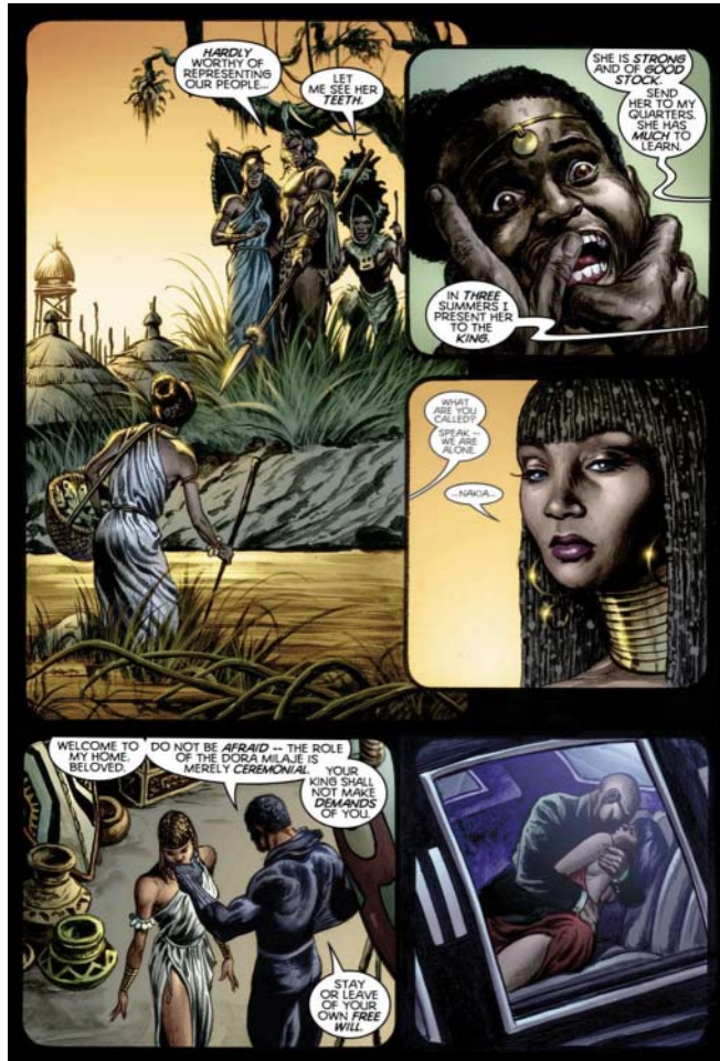
Figure 3 From Priest and Jusco (1999), Black Panther #6

deputies from Wakanda's many ethnic groups (Priest and Jusco 1999; see fig. 3). A brief glimpse into Nakia's past, in flashback form, shows her as a young girl fishing in shallow waters while counselors to the king stand above her in judgment, examining her from the banks of the stream to determine whether she can represent her people. After an extreme close-up in which an elder inspects Nakia's teeth to ensure she is "strong and of good stock," an elder proclaims, "In three summers I present her to the king." Nakia reappears as a bride adorned