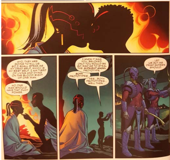
Figure 1 From Coates and Stelfreeze (2016), Black Panther #1

characters (see fig. 1). The silhouette of two women's heads backlit by a roaring fire in the first issue of Coates and Stelfreeze's series symbolizes both the characters' sexual passion and the stark contrasts communicated by their dialogue. As the shadows of their faces become one against the fire, they speak of themselves as "dead women," in light of their decision to reverse their prior commitments and start a rebellion against the Black Panther. Coates introduces this development in order to revisit a feature of the text inherited from Priest's era. To characterize the dilemma posed by his predecessors' treatment of sexuality, Coates gestures toward the desire to find grounding in history encoded in each iteration of the narrative. Whereas his explanation refers to plot developments that take place between Priest's tenure as writer of the series and Coates's own, I will go on to suggest that both authors are contending with fundamental quandaries posed by the endeavor to portray the setting of the text as both utopian and African.