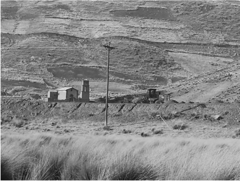
Figure 3. The Misisuni church now flooded below the reservoir's waters. Photo by the author, July 2016.

valley bottom to their new plots, greenhouses for seed production, solar panels, river and reservoir access for livestock, fish farms, scholarships and additional teachers for the valley's new public boarding high school, 600 additional homes for the communities' youth, and a well-stocked, first-rate hospital. López explains that from community members' point of view, "the first framework agreement regulated the period of dam construction by providing compensation for our lands and relocation of our homes. But it did not deal with how we are going to survive." 86 Communities have threatened to block Misisuni access roads and cut off water to the city if authorities do not comply, employing tactics similar to those long used by the project's advocates.