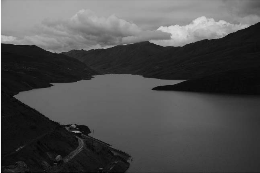
Figure 2. The Misicuni reservoir beginning to fill in 2017. Los Tiempos (Cochabamba), 17 June 2017.