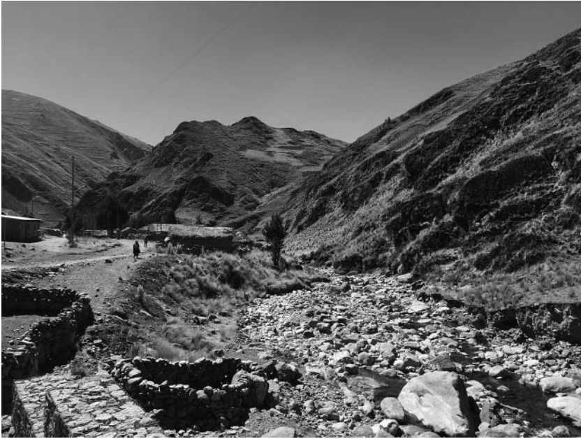
Figure 4. The Viscachas River entering the community of Colquechaca, which would be flooded if the Misicuni project expands. Photo by the author, July 2016.

While engineers have been interacting with these communities for many years, most Cochabamba residents are just now learning that their long-held enthusiasm for the Misicuni project is not shared by many people living in these watersheds. The question of whether it is morally defensible to increase the water supply for the populous Central Valley by razing the landscape and communities of more sparsely populated neighboring mountaintop valleys is one worth greater public attention and discussion than has occurred to date.