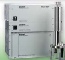
Flange Mounted Mass Spectrometers: RGAs to Research Instruments

High performance mass spectrometry systems and components