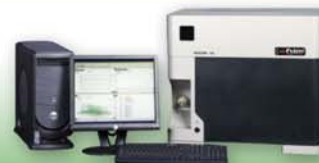
Gas Analysis Systems: 100% to low ppt detection limits, EI, CI and API sources