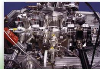
Standard and Custom MS and MS/MS Systems, TPD/TDS, Clusters, Plasma Analysis, Flow Tube and Molecular Beam