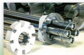
MS and MS/MS Components Ionizers, Ion Guides, Ion Optics, Mass Filters, RF and RF/DC Power Supplies