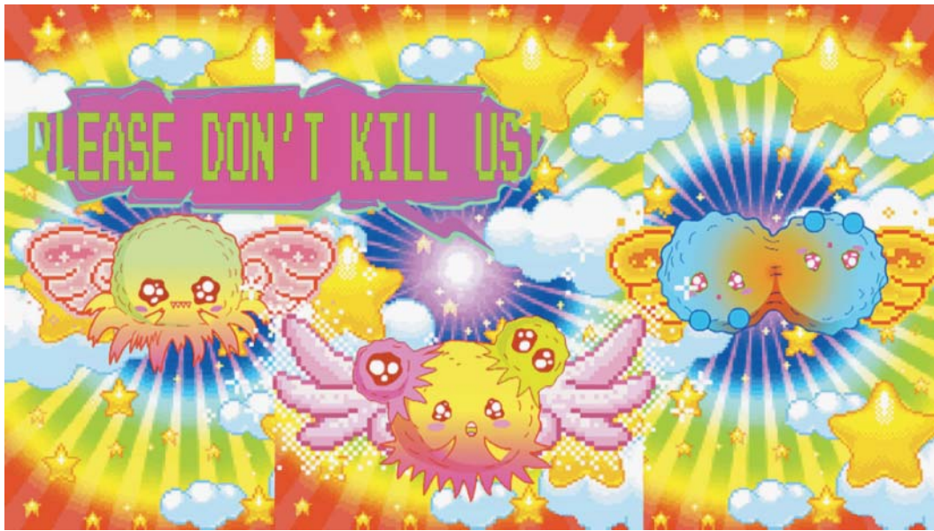
Figure 2. LuYang, Cancer Baby (2014–15), video still.

life worlds: the pharmacokinetic pill opens up pathways for the dead bodies of research animals inside da Costa's dying body while the greens suggest how the pill could be food and how food could be what Hannah Landecker would call "an immersive environment." 29