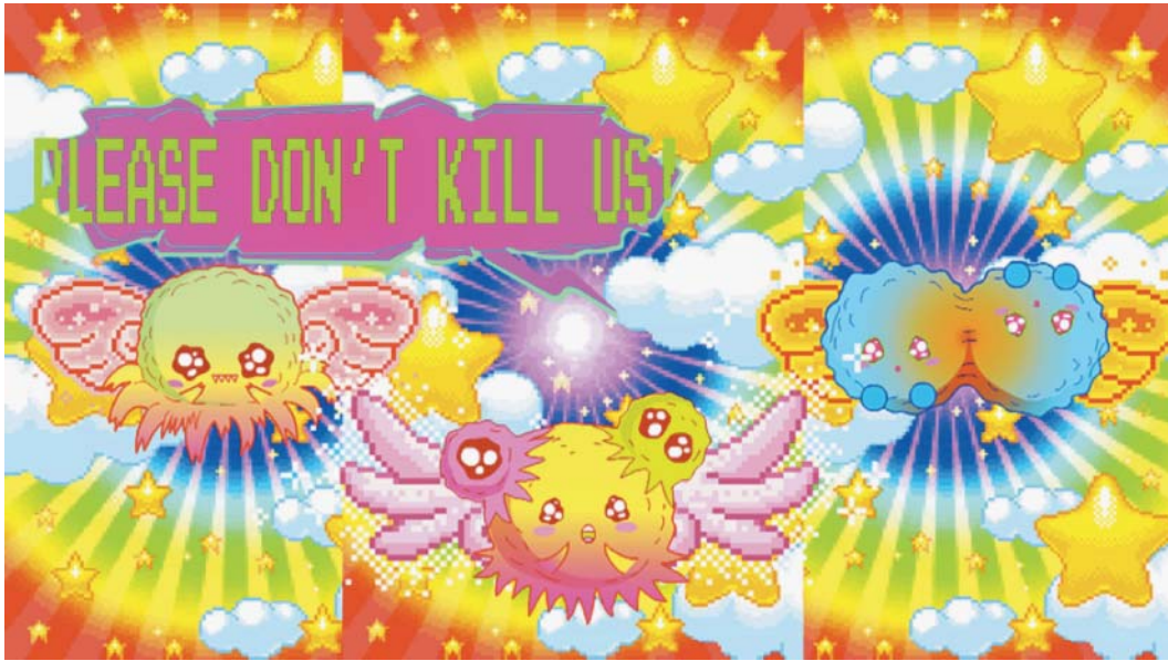
Figure 2. LuYang, Cancer Baby (2014–15), video still. Used by permission of the artist.

life worlds: the pharmacokinetic pill opens up pathways for the dead bodies of research animals inside da Costa's dying body while the greens suggest how the pill could be food and how food could be what Hannah Landecker would call "an immersive environment." 29