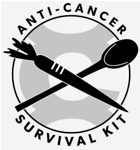
Figure 4. Top: Logo for the Anti-cancer Survival Kit . Bottom: Anarchy symbol by Enon.