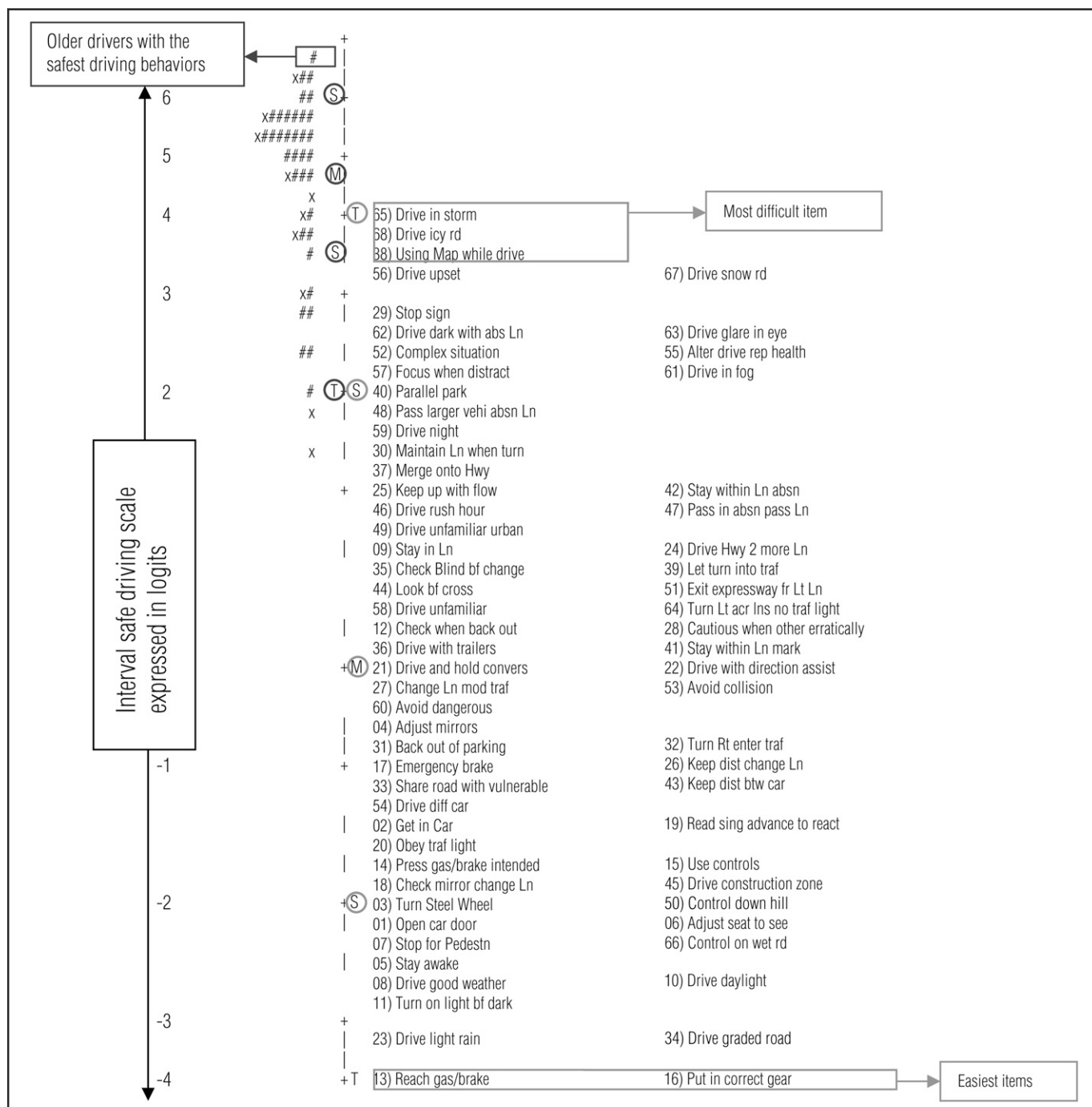
Figure 1. The ratings of the evaluator group on older drivers' safe driving ability versus item difficulty.

Even though mild ceiling effects existed for the caregivers (11%) and the person mean across the three rater groups was about 2 standard deviations higher than the item mean, this sample was high functioning, so the SDBM may have a sufficient level of challenging items to measure other older adult groups.