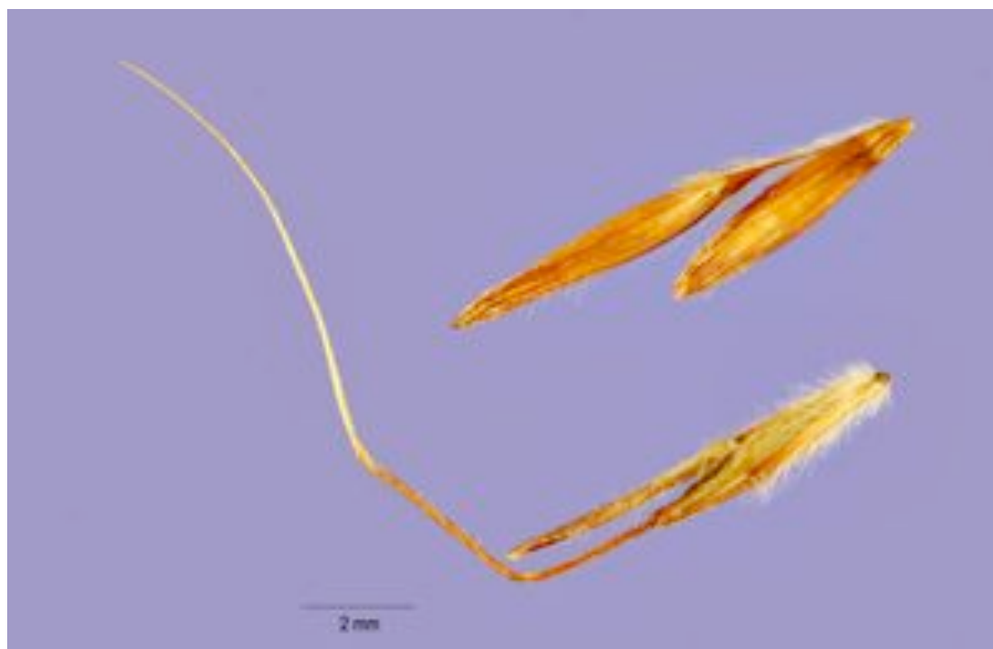
Figure 4 Seeds of Jaragua grass

humans helped Jaragua regenerate in their fields and facilitated its spread, like a rhizome, into the surrounding forest.