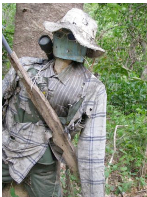
Figure 10 Duck hunting, the world making game of powerful foreigners, is illegal in Costa Rica. Some farmers of Bagatzí have become poachers, intruding onto the government nature preserve in Palo Verde managed by conservation biologists. This mannequin with a wooden ‘gun’ was installed by park guards on one of the dirt roads crisscrossing the national park. Guards made mimetic copies of themselves, aiming to startle intruders with uncanny specters (Photograph: Eben Kirksey)

sprouts are the favourite food of piches . When I arrived at his house late one night Gerardo was bustling in his back room—he had just taken a quick shower and was collecting his things. He wore a floppy round hat, a long sleeved shirt, and thick brown pants. Grey stubble was sprouting from his sun-baked brown skin.