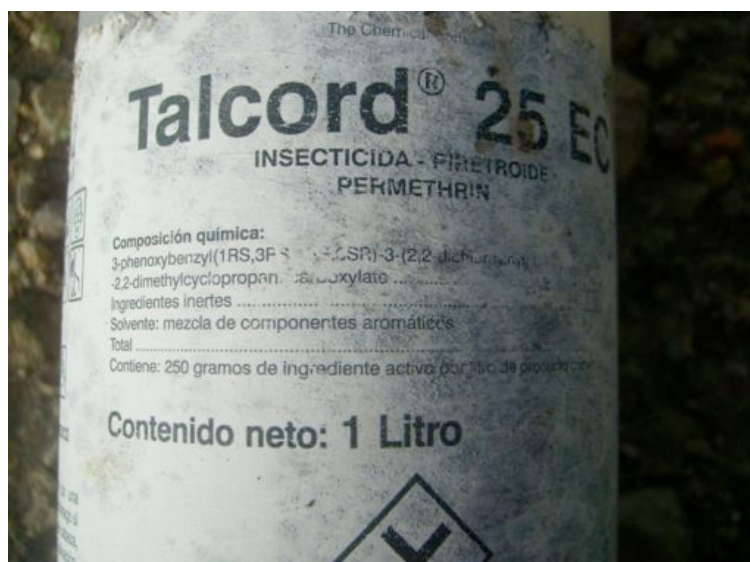
Figure 12