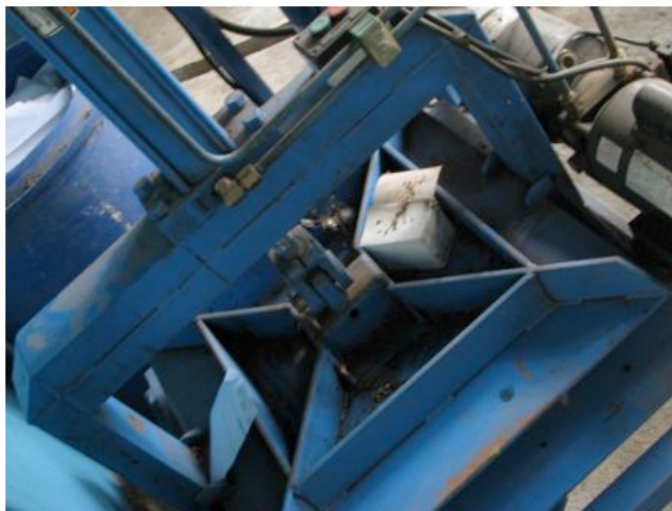
Figure 8 A machine in Tifa Tours that broke down while printing diplomas for University of Costa Rica graduates. The cooperative became inactive after the machines stopped functioning. Spectral promises made to the women of Bagatzí—fictions and fabulations about modernity—evaporated as the fickle spirit of capital danced away

Cattails proved resistant to capture by capitalism and remained as persistent parasites—interrupting human dreams. This rhizomorphic plant broke the motorised machines of this modest paper-making project just as the operation was starting to get off the ground. 69 Visions of turning Bagatzí into a picturesque ecotourist destination, by establishing bunk beds for visitors who might want to tour marshes full of Typha dominguensis , also failed. I lived alone in Tifa Tours surrounded by hulking machines that had been abandoned by the ghostly specter of capital. “Our equipment is worth a lot of money,” Ana Janzen told me, “but none of us have the technical skills to fix it. The machines are very heavy, and it would cost a lot to bring them somewhere for repairs.”