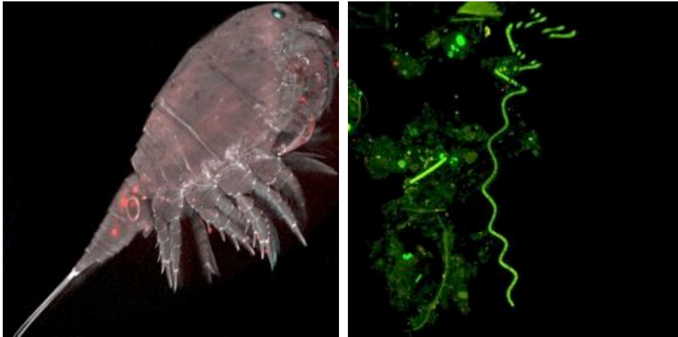
Figures 17 & and 18 More unloved others of Palo Verde.

Following the graduate students into a zone of abandonment, I gained access to microscopes and became a voyeur in the worlds of aquatic microbes from Palo Verde. I encountered spirulina algae, single-celled paramecia, as well as multiple species of decapods. Tiny twinkling dots, like small stars, moved around in the water just beyond the microscopes' resolution. For me these twinkling dots became figures of the cosmos, the unknown beyond fragile structures of human knowledge, full of lurking strangers who may be friend or foe. 91 In this complex field of ecological relations, a cautionary injunction from Joe Dumit came to mind: "Never think you know all the species involved in a decision. Corollary: Never think you speak for all of yourself." 92