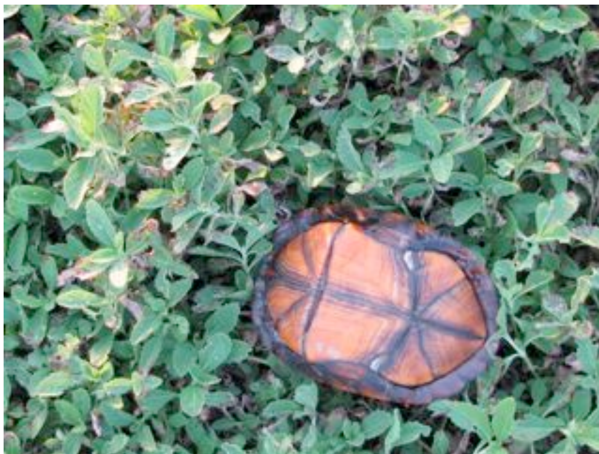
Figure 15 A turtle hiding in its shell near a fanguero tractor rolling through the wetlands of Palo Verde National Park

The speech prosthetics of these graduate students were fragile. They only sampled six sites in open water, and five sites in cattail stands. Senior scientists in residence at Palo Verde Biological Station never conducted a follow up study with larger sample sizes to track the populations of these organisms through time. Instead of trying to create a democratic assembly, a unified Parliament of Things where all creatures of the wetlands might one day be represented, the park officials were being moved by oblique powers. Amidst competing visions of conservation and agricultural production, shifts in these oblique powers were determining who lived and died. “The perspective of the Parliament of Things belongs to a utopia,” in the words of Isabelle Stengers. “It is nothing more than an empty dream if it does not function as a diagnostic vector for what makes it a mere utopia, as a learning ground for resisting what today opportunistically frames our world.” 86