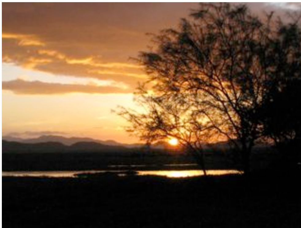
Figure 3 Palo Verde National Park pictured at sunset