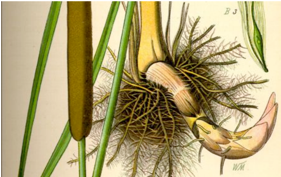
Figure 5 The rhizome of the cattail

preferred to graze in dry grasslands where the conservationists were trying to regrow a forest. These cattle proved ineffective in killing the cattails. 50