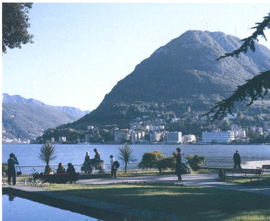
Lake Lugano promenade and Mt. San Salvatore.

In the tradition of past conferences, PC '94 will present a detailed overview of the newest research results and developments in computational methods for academia and industry. Conference chair Ralf Gruber of CSCS says, "We