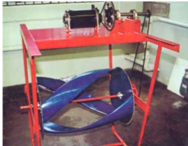
Power systems for free flows with different helical turbines