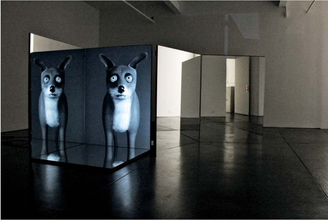
Figure 3. Ann Lislegaard, Time Machine (2011). Unfolded mirror box, HD video projection, 3-D animation with sound, 5:26 mins. Exhibited Nineteenth Biennale of Sydney (2014) at Carriageworks, Sydney. Reproduced courtesy the artist and Murray Guy Gallery, New York.

extinction. Time Machine is both an environment that houses a machinic animal body and a space that challenges the material constraints of time. The outer boundary of the work is a three-sided mirrored cubicle large enough to house a wild animal. Within its dark and unfolding space a glitchy, reflective, animated fox attempts to recount a recent journey to the future. If this were one fox telling one story then perhaps we could see it as mechanical: a trapped and anthropomorphized fox in imitation of a human. But the box, its reflections, and the continual stuttering unintelligibility of the improbable narrative point toward a different kind of body—one that questions how viewers and artworks are oriented in space and time.