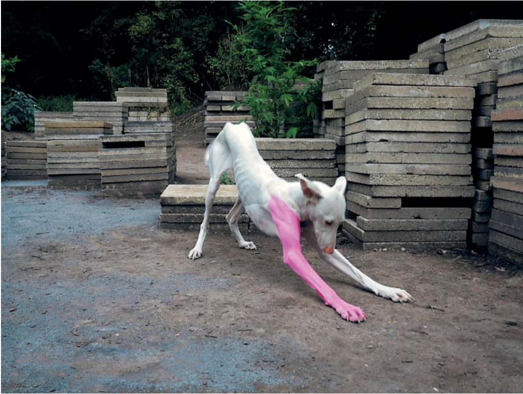
Figure 2. Pierre Huyghe, Untilled (2011–12). Living entities and inanimate things, made and not made.

we experience the transformation of the concrete by the bees as a relationship of animation and assemblage.