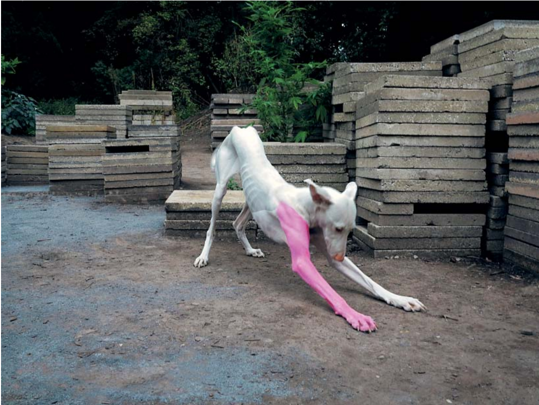
Figure 2. Pierre Huyghe, Untilled (2011–12). Living entities and inanimate things, made and not made. Courtesy the artist; Marian Goodman Gallery; Esther Schipper, Berlin.

we experience the transformation of the concrete by the bees as a relationship of animation and assemblage.