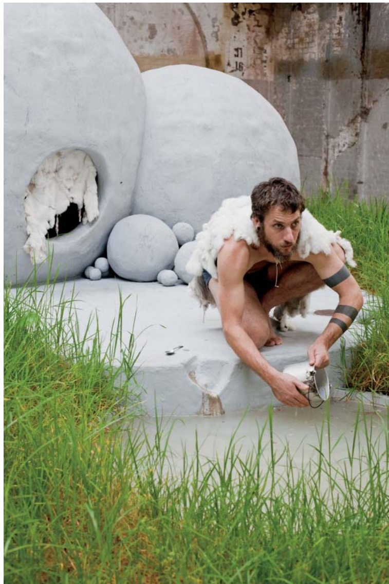
Figure 7. Hayden Fowler, Anthropocene (2011). Mixed-media installation, 5 × 6.5 × 6.5 m. Exhibited at “Awfully Wonderful: Science Fiction in Contemporary Art,” curated by Lizzie Muller and Bec Dean, Performance Space at Carriageworks, Sydney, Australia, April 15 – May 14, 2011.

species extinctions. It is not clear if at one time this environment was part of a city, a new urban habitat, or something else not made by humans at all. Despite its depleted state, this corner of a future world is currently living. It is neither romantic nor nostalgic, but it is breathing, alive. It is disturbed and remade by the lost bodies of a new kind of cohabitation. Fowler and his island rats are survivors, but without bees to pollinate the grass and rain to fill the pond, their small green eco-sanctuary may soon fester. Already some children have thrown sticks at the island inhabitants. Fowler shows that animals can indeed adapt to new machinic environments, but that the environments themselves also need to adapt. 53 Anthropocene is an ethical pointer toward a future