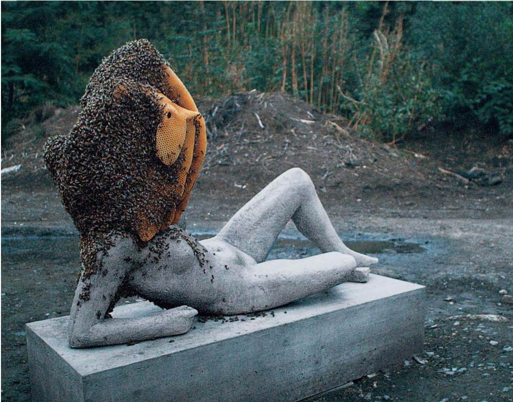
Figure 1. Pierre Huyghe, Untilled (2011–12). Living entities and inanimate things, made and not made. Courtesy the artist; Marian Goodman Gallery; Esther Schipper, Berlin.

In the original installation at Kassel, Untilled (Liegender Frauenakt) was part of a series of interventions that occupied the compost area in the Karlsau Park. There the bees performed pollination duties for an intoxicating garden of deadly and psychotropic plants planted and curated by Huyghe. In the Centre Pompidou the visible garden is absent; the bees forage for nectar and pollen by traveling down a small tube that connects the aesthetic space with the raw streets of Paris outside. In this sense, Untilled (Liegender Frauenakt) is both a sculpture and a social landscape. The multispecies and sympathetic structure of the sculpture becomes a site for an ever-increasing cycle of living interactions. It travels across time and space. Eventually, the concrete will leach and break down, the speed of disintegration increased by processes of carbonation. Whether or not they are aware of it, the bees have been tasked with the role of artists. Their actions will determine the longevity of their adopted home. If they allow carbonation to occur, they risk their infrastructure dissolving; but if they coat the sculpture with wax, the entire environment could overheat. The primary manipulation of matter has shifted from the hands of Modigliani, to manufacturing by Weber, then Huyghe, and now a collective of bees. Together the bees and concrete are a vital sympathetic system, and as viewers