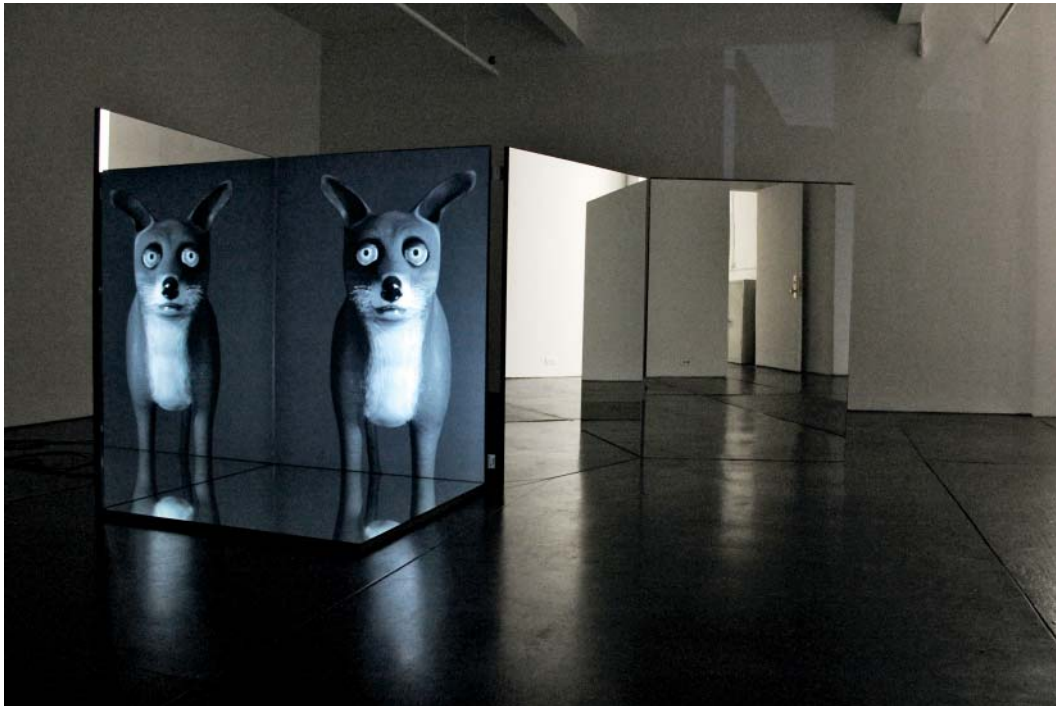
Figure 3. Ann Lislegaard, Time Machine (2011). Unfolded mirror box, HD video projection, 3-D animation with sound, 5:26 mins. Exhibited Nineteenth Biennale of Sydney (2014) at Carriageworks, Sydney. Reproduced courtesy the artist and Murray Guy Gallery, New York.

extinction. Time Machine is both an environment that houses a machinic animal body and a space that challenges the material constraints of time. The outer boundary of the work is a three-sided mirrored cubicle large enough to house a wild animal. Within its dark and unfolding space a glitchy, reflective, animated fox attempts to recount a recent journey to the future. If this were one fox telling one story then perhaps we could see it as mechanical: a trapped and anthropomorphized fox in imitation of a human. But the box, its reflections, and the continual stuttering unintelligibility of the improbable narrative point toward a different kind of body—one that questions how viewers and artworks are oriented in space and time.