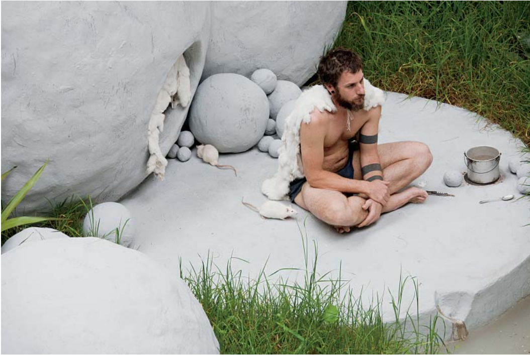
Figure 8. Hayden Fowler, Anthropocene (2011). Mixed-media installation, 5 × 6.5 × 6.5 m. Exhibited at “Awfully Wonderful: Science Fiction in Contemporary Art,” curated by Lizzie Muller and Bec Dean, Performance Space at Carriageworks, Sydney, Australia, April 15 – May 14, 2011.

culture where it is not enough to think of evolution and extinction in terms of relationships between animals and environments. 54