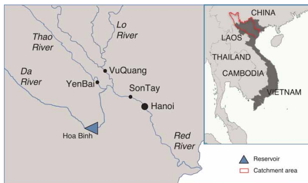
Figure 2 | The Hoa Binh reservoir water system in Northern Vietnam.

In all the optimization experiments, Extra Trees was used to approximate the state-action-value function, with M=100 trees and a number of alternative cut directions K equal to 3 for FQI and 4 for MOFQI. After some trial and error, the threshold \tau for computing the score function described in the section on improved Extra Trees was set to 0.9 (again, threshold values higher than 0.8 all provided comparable results). The number of algorithm iterations L was decided based on the analysis of the system functioning. From the definition of the hydropower objective, it follows that the optimal reservoir operation should allocate the hydropower production in the period of maximum energy value, i.e. from April to June. The storage to sustain such production must have been created in the previous flood season