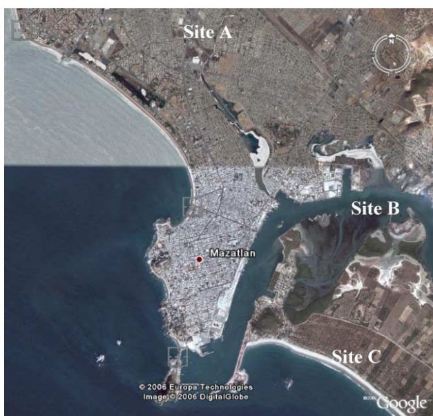
Figure 2 | Sampling sites from Mazatlan.

from the coastline at 30 cm depth. Temperature (degrees Celsius) and pH were measured immediately after arriving at the laboratory with portable thermometer and pH devices (Waterproof Double Junction pHTestr 3 + ; Oakton Instruments, USA). Turbidity (NTU: Nephelometric Turbidity Units) and salinity (ppt: parts per thousand) were measured at the laboratory with a turbidimeter (2100P Portable Turbidimeter; HACH Company, USA) and salinometer (HI 98203 Salintest; Hanna Instruments, USA), respectively.