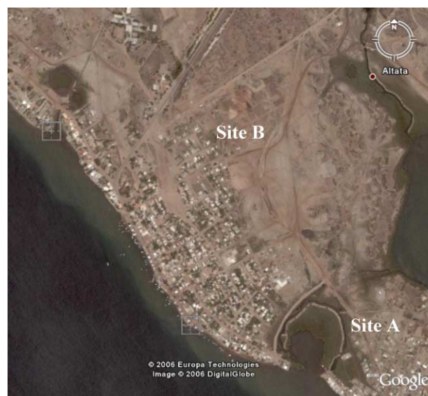
Figure 1 | Sampling sites from Altata Bay.

Water temperature, pH, turbidity and salinity were measured at each sampling site. Water was collected 15 m