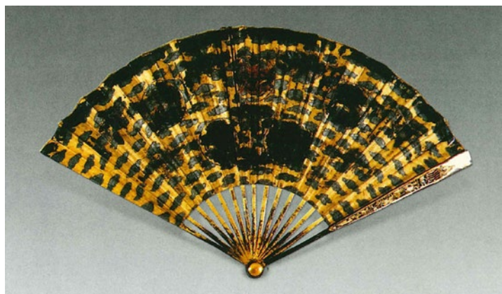
Figure 3. Folding fan with bamboo skeleton and silk paper. 32 × 55 cm. Excavated from the tomb of Zhu Yiyin, King Yixuan of the Ming dynasty 益宣王朱翊鉞 (1537–1603). See Jiangxi sheng bowuguan 江西省博物館, ed., Jiangxi Mingdai fanwang mu 江西明代藩王墓 ( Ming-Dynasty Prince Tombs in Jiangxi ). Beijing: Wenwu Chubanshe, 2010, pl. 62.6.

and imperial family members in the lower Yangzi Delta. At least sixty-five folding fans were found in seventeen Ming tombs, and they were commonly placed near the tomb occupants. Many of the fans were in the Japanese style, with a solid gold ground or with many gold dots spread across the paper surface (see fig. 3; Xia 2008: 79).