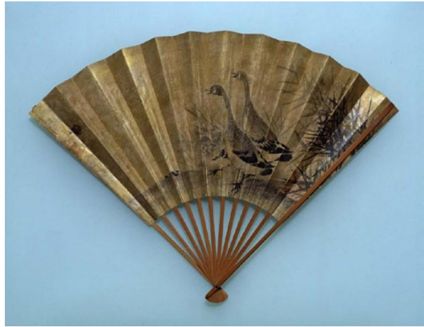
Figure 2. Paper folding fan by Kanō Masanobu 狩野正信 (1434–1530). 18.8×43.3 cm. Collection of Tokyo National Museum.