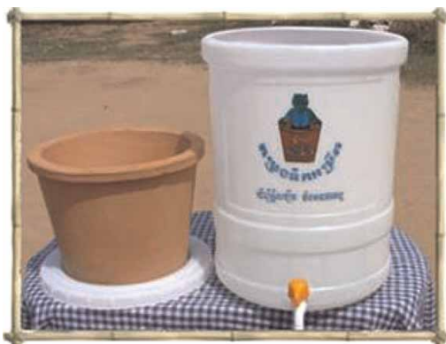
Figure 1 | RDIC clay pot filter and receptacle.

The E. coli Famp (ATCC 700891) stock used to produce the detection bacteria for each experiment run was a log-phase