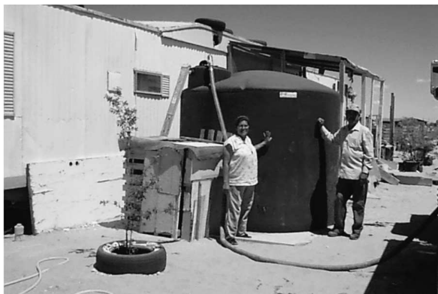
Figure 1 | 2500-gallon water storage tank provided in intervention.

Data were collected between September 1998 and December 1999 in four contiguous communities of El Paso County, Texas where a community-based organization had received funding to install 102 2,500-gallon water storage tanks. Data on water collection, use, and storage practices were gathered through face-to-face interviews. The research design called for data to be collected before installation of the large storage tanks (the intervention), one month after the intervention and nine months after the intervention.