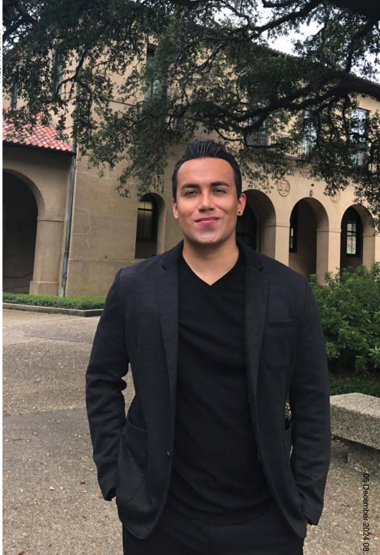
FIGURE 1. THE AUTHOR , in his interview clothes, stands outside Louisiana State University's quantum photonics laboratory. He now leads the lab as a faculty member in the physics department.

The cover letter's purpose is to provide a broad description of your research and other professional achievements. It should