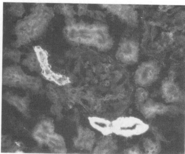
FIGURE 3. Anti-smooth muscle staining is limited to the small artery and arteriole illustrated in this micrograph. The renal glomerulus and peritubular fibrils are negative. (× 224.)