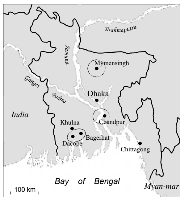
Figure 1 | Map of Bangladesh showing the major rivers and larger cities. The respective sampling areas are indicated with circles.

night) in the drying oven the filters were checked for dryness and dry filters were stored cool (when possible at 4 °C) in an airtight box with dry silica gel. From each water sample duplicate subsamples for toxin analysis were prepared and transported to Germany.