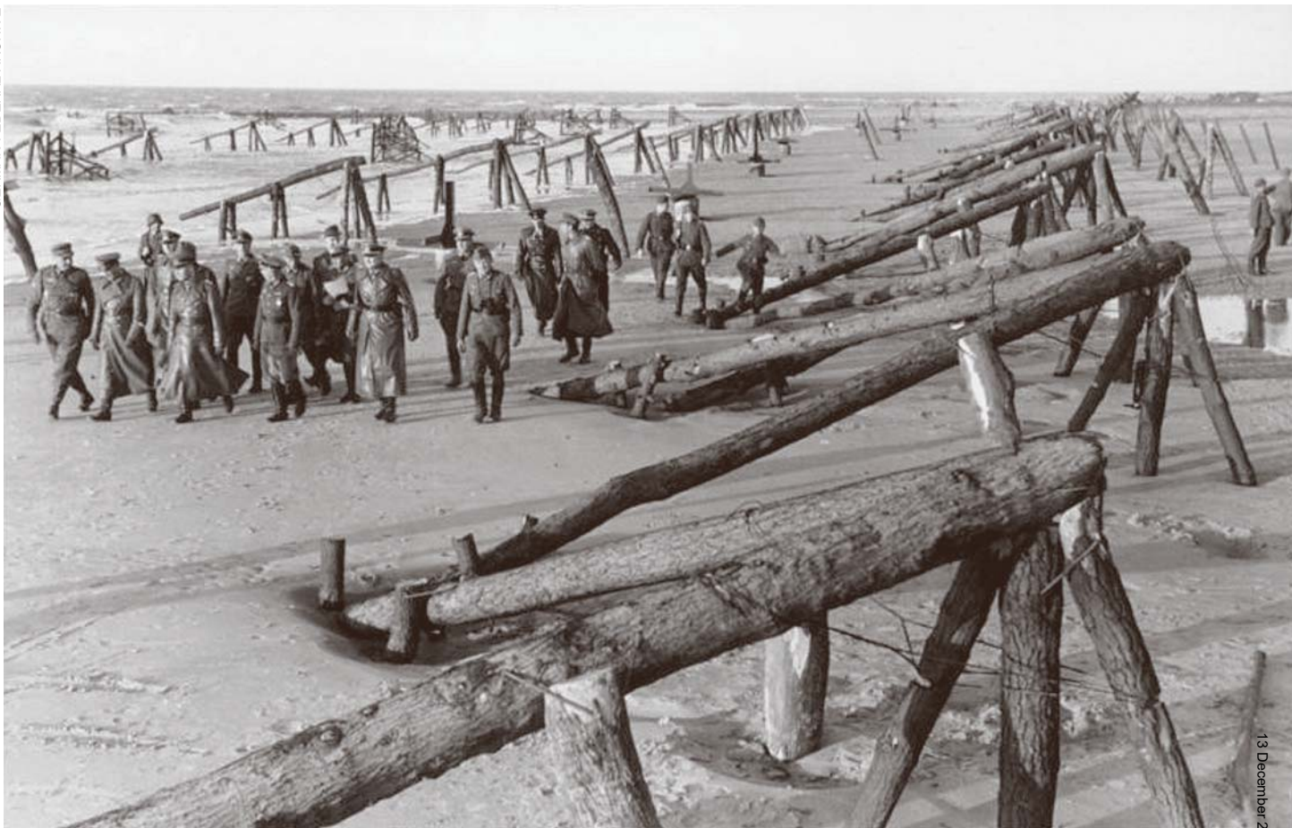
Figure 1. German Field Marshal Erwin Rommel (front row, third from left) on the French channel coast in April 1944, at low tide. He was inspecting some of the millions of obstacles he had ordered built between the low- and high-water lines on beaches where the Allied invasion force might land.

the Earth-covering waters into several large oceans. Newton, having assumed for simplicity that the sea responds instantaneously to the astronomical forces, essentially ignored all hydrodynamic effects—for example, the effect on the tide of the natural oscillation frequency of an ocean basin, something that Galileo had recognized.