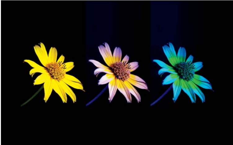
Figure 2. Jerusalem artichoke in human vision (left), simulated butterfly vision (middle), and simulated bee vision (right), Both butterflies and bees can see into the near-ultraviolet (UV-A).

wonder, is all this related to astrobiology's ongoing search for extraterrestrial life? Crucially, ultraviolet shining is not limited to the macro-scale of heavenly bodies. At the micro-scale, it is ubiquitous as well, and it can be used as a marker for life. I first learned about this when I attended an astrobiology conference in Stockholm some years ago. On that occasion, I happened to get caught up in a conversation about honeybees with two other attendees. It was during a coffee break, and my two companions went on about bees' capacity to find nectar by means of ultraviolet signposts or "landing marks" on the flowers they visit.