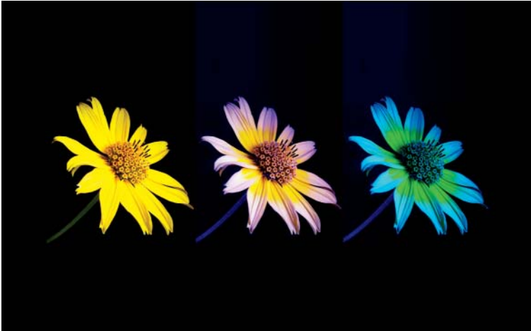
Figure 2. Jerusalem artichoke in human vision (left), simulated butterfly vision (middle), and simulated bee vision (right), Both butterflies and bees can see into the near-ultraviolet (UV-A). Used with permission.

wonder, is all this related to astrobiology's ongoing search for extraterrestrial life? Crucially, ultraviolet shining is not limited to the macro-scale of heavenly bodies. At the micro-scale, it is ubiquitous as well, and it can be used as a marker for life. I first learned about this when I attended an astrobiology conference in Stockholm some years ago. On that occasion, I happened to get caught up in a conversation about honeybees with two other attendees. It was during a coffee break, and my two companions went on about bees' capacity to find nectar by means of ultraviolet signposts or "landing marks" on the flowers they visit.