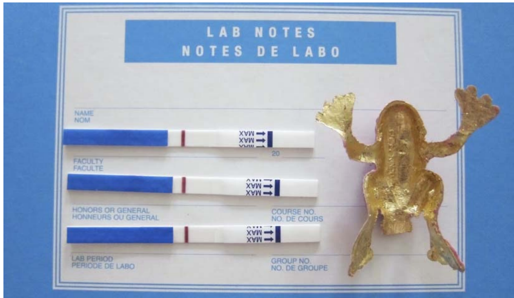
Figure 3. The negative pee-stick tests used by the couple after their performance of the Xenopus pregnancy test.

pregnancy test. “Once we knew we’d have to do it, we ran over to a friend’s house as fast as we could to find out,” the couple wrote in a blog post.