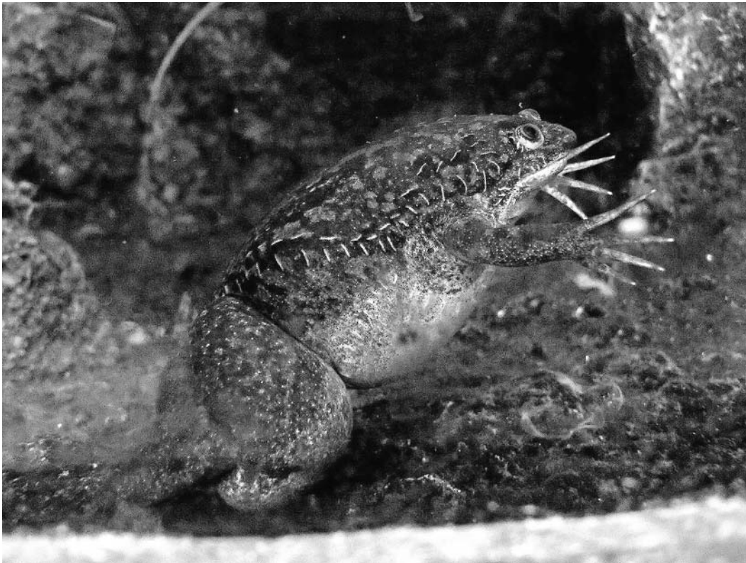
Figure 2. An African clawed frog ( Xenopus laevis ) resting underwater in an aquarium at Ueno Zoo, Tokyo. Photo by Peter Galaxy. Creative Commons Attribution-Share Alike 2.5 Generic, 2.0 Generic, and 1.0 Generic license.jpg

human families, meant that Loretta had no choice but to participate in our experiment. We purchased her with a credit card from 1-800- Xenopus , the toll-free hotline for a specialty laboratory animal supply company (fig. 2). Still, Loretta helped illustrate a deep kinship shared by humans and frogs—a similar biochemical makeup shared across divergent evolutionary lineages, with reproductive functions triggered by shared hormones. Once viewed as primitive creatures by experimental biologists, Xenopus frogs were formerly thought to be unable to experience feelings of pain or fear. But recent research has led to the revision of these earlier assumptions. According to a laboratory manual published in 2010 by the Taylor and Francis Group, “ Xenopus have all of the neuroanatomical pain pathways as seen in mammalian species, and thus, like mammals, they are capable of experiencing pain.” 26