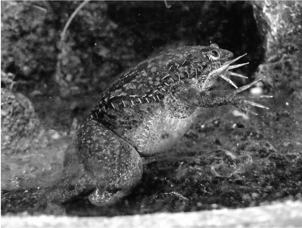
Figure 2. An African clawed frog ( Xenopus laevis ) resting underwater in an aquarium at Ueno Zoo, Tokyo. Photo by Peter Galaxy. Creative Commons Attribution-Share Alike 2.5 Generic, 2.0 Generic, and 1.0 Generic license.jpg

human families, meant that Loretta had no choice but to participate in our experiment. We purchased her with a credit card from 1-800- Xenopus , the toll-free hotline for a specialty laboratory animal supply company (fig. 2). Still, Loretta helped illustrate a deep kinship shared by humans and frogs—a similar biochemical makeup shared across divergent evolutionary lineages, with reproductive functions triggered by shared hormones. Once viewed as primitive creatures by experimental biologists, Xenopus frogs were formerly thought to be unable to experience feelings of pain or fear. But recent research has led to the revision of these earlier assumptions. According to a laboratory manual published in 2010 by the Taylor and Francis Group, “ Xenopus have all of the neuroanatomical pain pathways as seen in mammalian species, and thus, like mammals, they are capable of experiencing pain.” 26