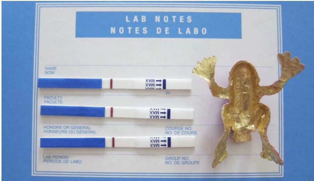
Figure 3. The negative pee-stick tests used by the couple after their performance of the Xenopus pregnancy test.

pregnancy test. “Once we knew we’d have to do it, we ran over to a friend’s house as fast as we could to find out,” the couple wrote in a blog post.