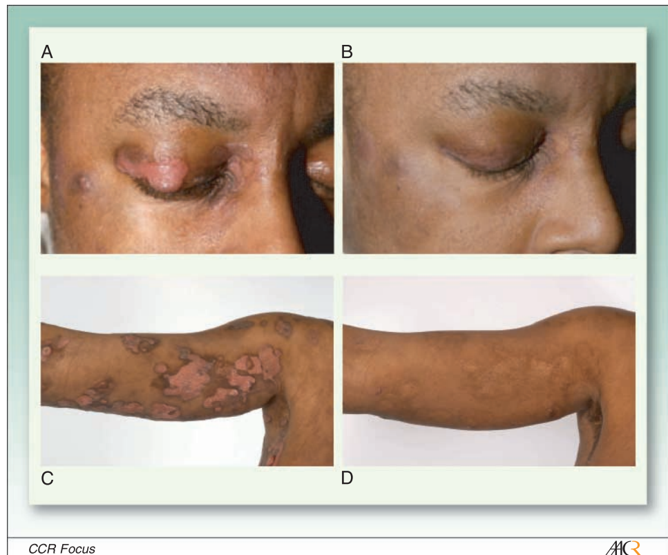
Fig. 1. This patient with tumor stage CTCL was enrolled on a phase II trial of romidepsin for patients with CTCL or PTCL and treated at 14 mg/m 2 on a day 1, 8, and 15 schedule every 28 d (50). A , As shown in the upper panel, a lesion next to the eye and on the eyelid showed significant improvement, B , after the first cycle of therapy. Lesions in other areas of the body also showed significant response, as shown in the photograph, C , of her right arm prior to and, D , 5 mo after starting therapy. This partial response lasted 15 mo.