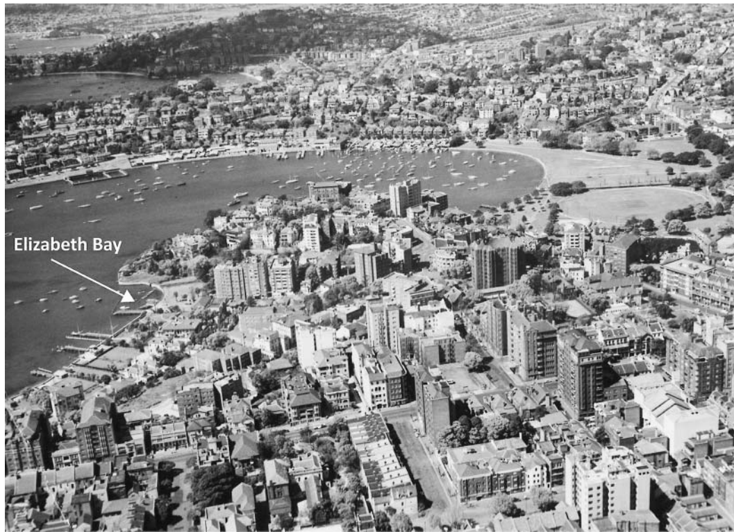
Figure 1. Pre–World War II aerial view with Elizabeth Bay at the left and Rushcutters Bay, center.

material conditions that are handed down to us” and that these conditions—reclamations might constitute one such condition—represent a history that is not purposeful but “emergent and full of unspecified potential.” 13 As portents, reclamations may indeed evoke a future of continued and even intensified human monopolization of coastal ecologies, but they do not determine it. An archaeological sensibility might help us appreciate how and why reclamations have been carried out, how they behave as objects, the nature of our entanglement in them, and the possibilities for less destructive entanglements.