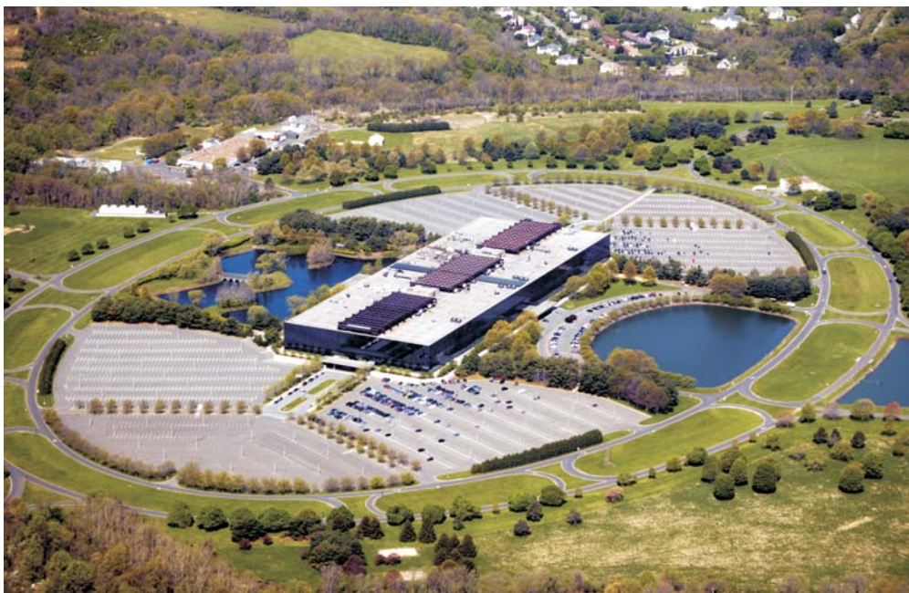
Figure 1. Bell Laboratories Holmdel Complex in New Jersey was designed by Eero Saarinen. Once home to more scientists than found at a major university, the building now stands empty.