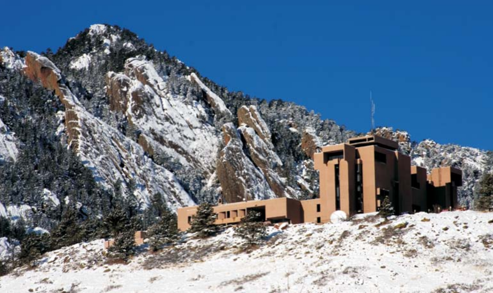
Figure 2. The Mesa Laboratory , designed by I. M. Pei for the National Center for Atmospheric Research, was conceived with the surrounding Colorado Rockies in mind. Its founding vision included the notion of small teams and a sense of community, but as climate science grew in complexity, NCAR had to expand beyond its signal lab.