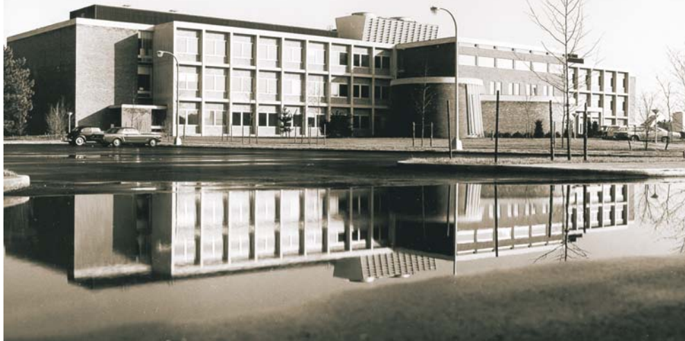
Figure 3. Building 555, designed by Marcel Breuer, houses chemists at Brookhaven National Laboratory in New York. Nearly 50 years after it opened, the lab is still functionally and technically sound, according to the architectural firm that is currently planning its renovation.