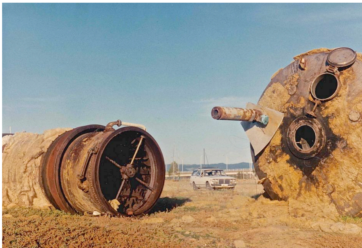
Figure 3 Rusty hoppers left on Lartelare's site after the demolition of the CSR Refinery. Schultz made recordings in and around the hoppers. CD booklet image, courtesy Chester Schultz.

The following track, "Ground Water, Sea Water," depicts the swirling fluvial debris of a century of construction and deconstruction. One is riveted to sit still and listen.