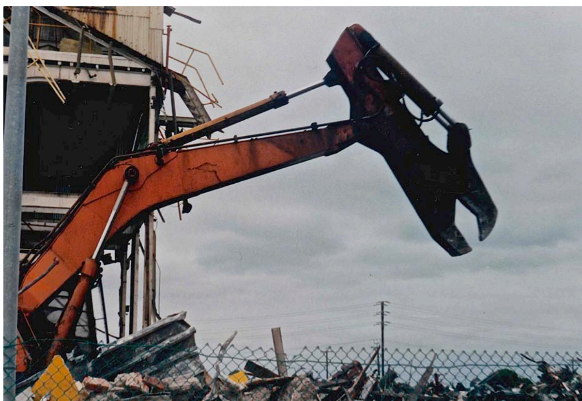
Figure 2 One of the huge machines of demolition at the CSR Sugar Refinery at Glanville, January 1993. CD booklet image, courtesy Chester Schultz.

"Islands of Quietness," to revisit my epigram—are "rarely included in the equations of urban developers." "The Beasts of Babylon" (Track 11) references the "ruined City," a spiritual metaphor from The Revelation of John: "Babylon the Great is fallen." 76 This recurring motif in Schultz's work is generally inclusive of people who live on a city's margins. However Within Our Reach extends the metaphor to the natural environment on the margins including the arboreal habitats of sparrows and pigeons destroyed in the ensuing acoustic disaster. Schultz was quick to photograph and record the overbearingly loud, clanking cranes and other hard-shelled industrial machines (Figures 2 and 3) that demolished the Sugar Refinery in January 1993, following on from its closure in 1991. Track 11 graphically depicts one "beaked monster" grabbing huge scraps of metal while a sewage pipe pisses 37 million litres of effluent (daily) into the river at the Causeway where the Reach was "beheaded."